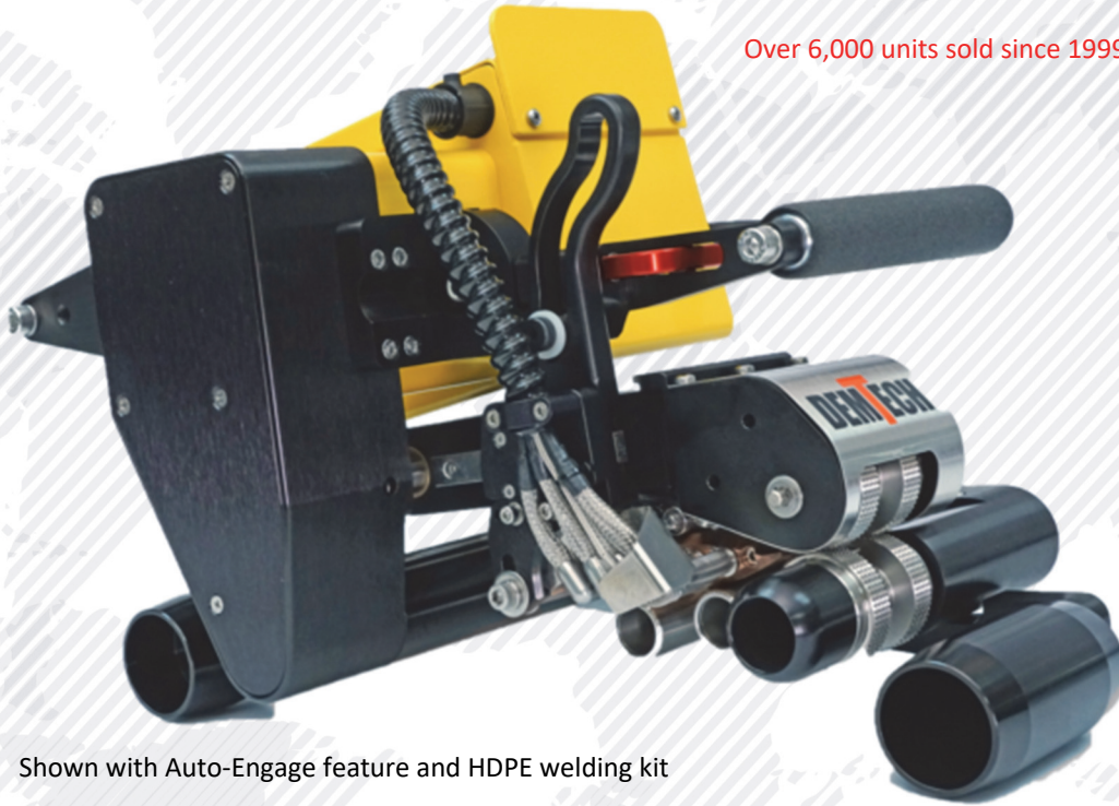
Shown with Auto-Engage feature and HDPE welding kit