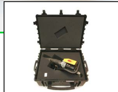
Includes custom shipping/storage case, sealed for protection against moisture, with foam insert.

Call "Demo Dave" today for information on a test drive. (888) 324-WELD (specifications on reverse)