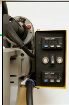
Electronic switches and controls are easy to use and are protected from damage and accidental adjustment.