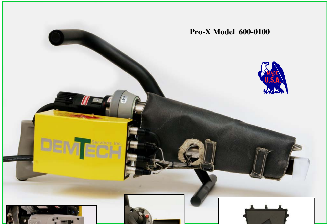
Pro-X Model 600-0100

High output extrusion gun for production welding of geomembranes and rigid thermoplastics.